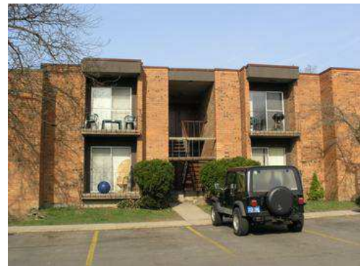
View 15 - 2 Bedroom Exterior