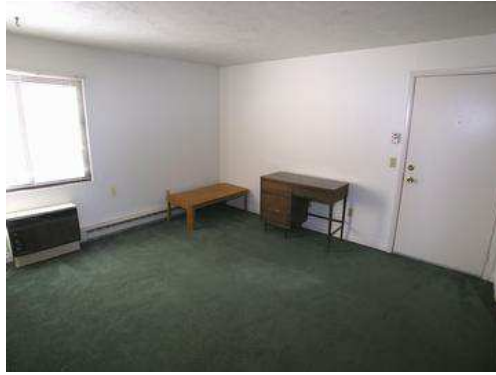
View 5 - Living