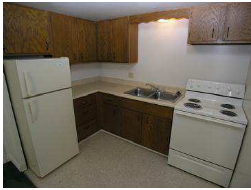
View 2 - Kitchen