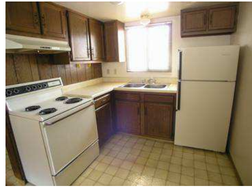
View 9 - Kitchen