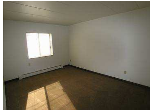
View 18 - Bedroom