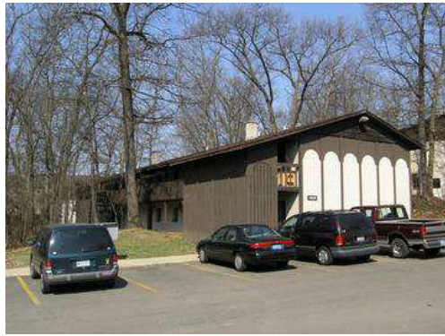
View 8 - 1 Bedroom Exterior