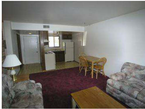
View 11 - Living