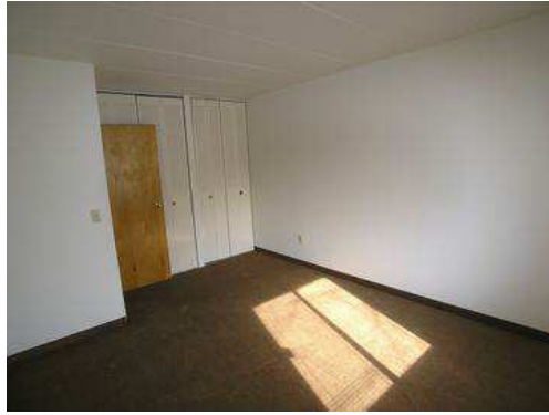
View 20 - Bedroom