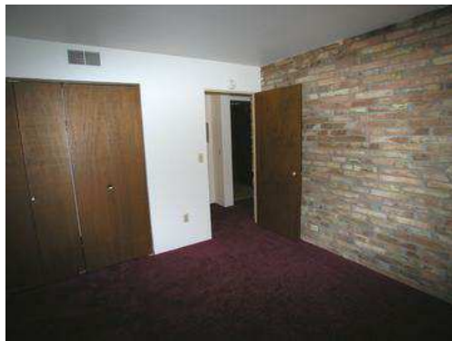
View 14 - Bedroom