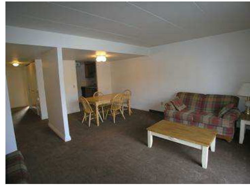
View 24 - Family