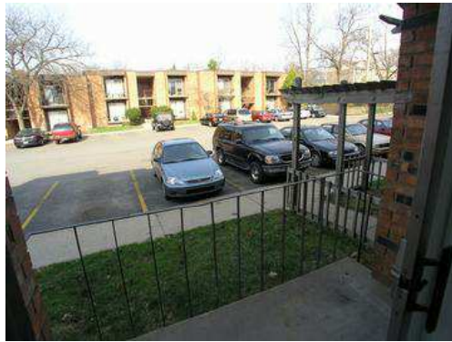
View 26 - Deck