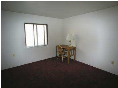
View 13 - Bedroom