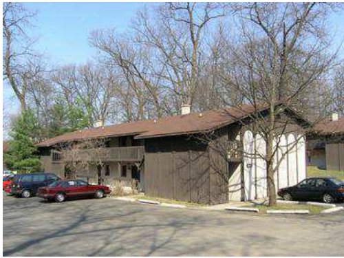
View 7 - 1 Bedroom Exterior