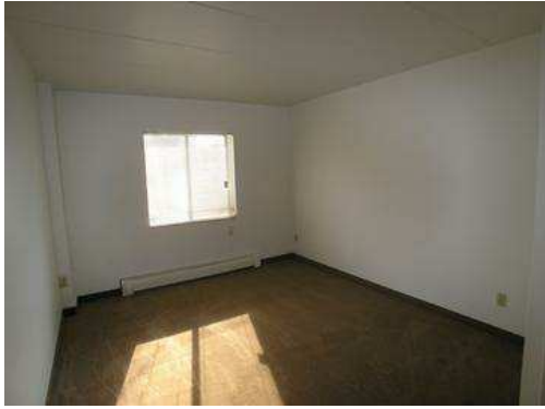
View 19 - Bedroom