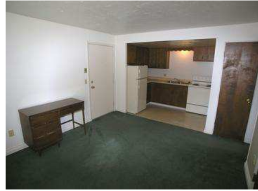
View 6 - Living