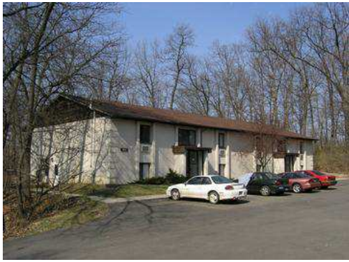
View 1 - Efficiency Building