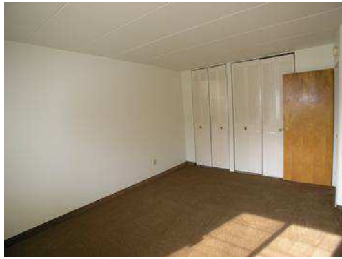
View 17 - Bedroom