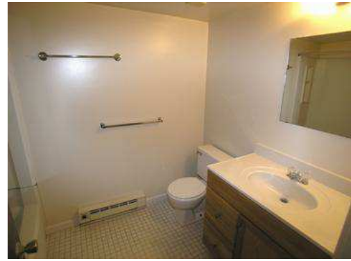
View 3 - Bath