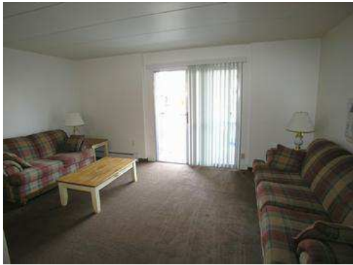
View 25 - External