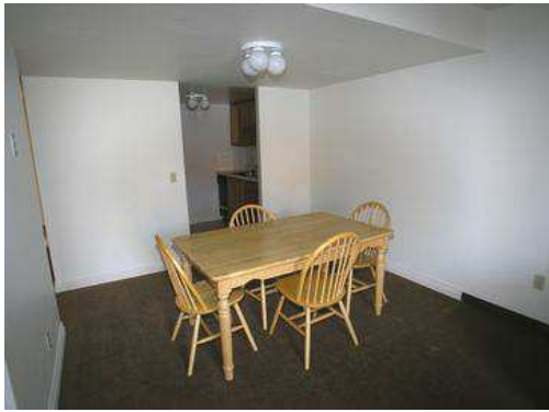
View 22 - Family