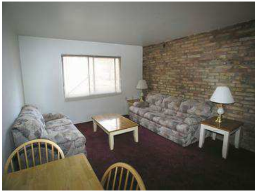
View 10 - Living