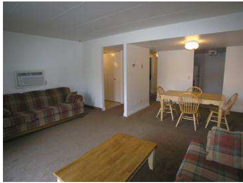
View 23 - Family