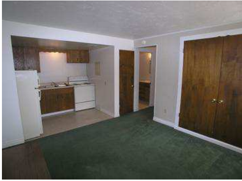
View 4 - Living