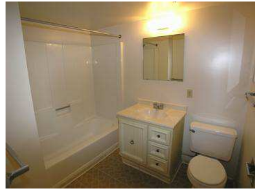
View 12 - Bath