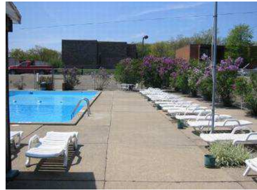
View 27 - Pool