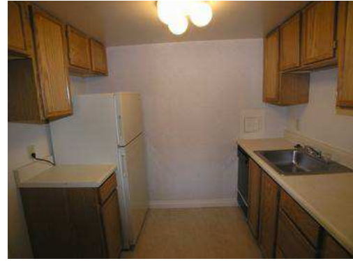
View 21 - Kitchen