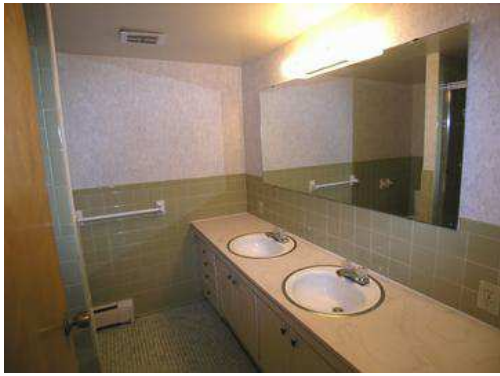
View 16 - Bath